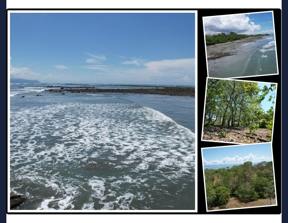
This 1.5 hectare lot is fully titled, free and clear, and just steps away from the sand and tide pools of Guanábana Beach, about fifteen minutes south of town.