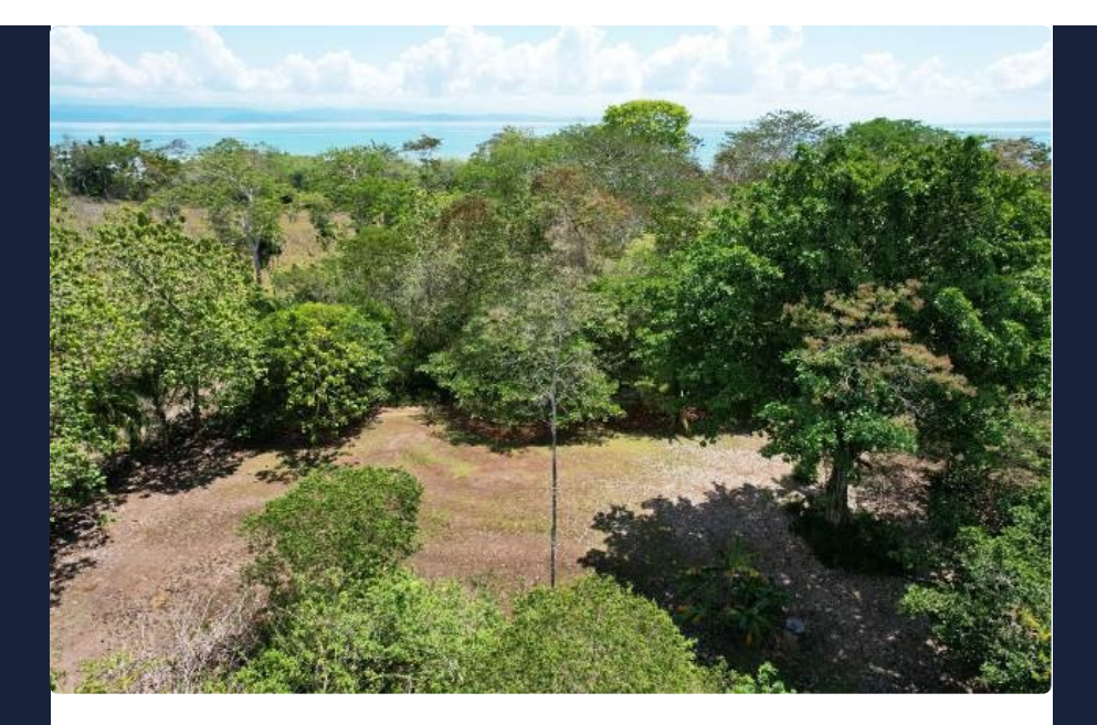
There is a well on the property, ready to put into production.