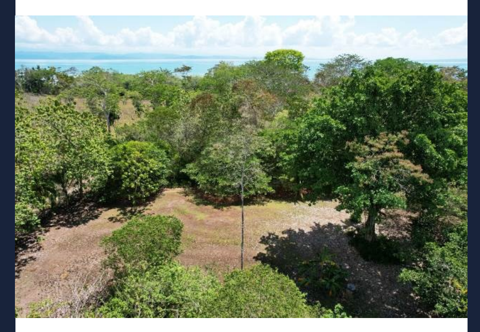
There is a single surf break that goes off when swells arrive from storms in the Southern Ocean, but outside of swells the wave action is not big enough for surf but great for swimming.

Join an eclectic neighborhood of expat residents and newly arrived that own from the highway all the way down to the beach on the south side of the Guanábana Beach public road.