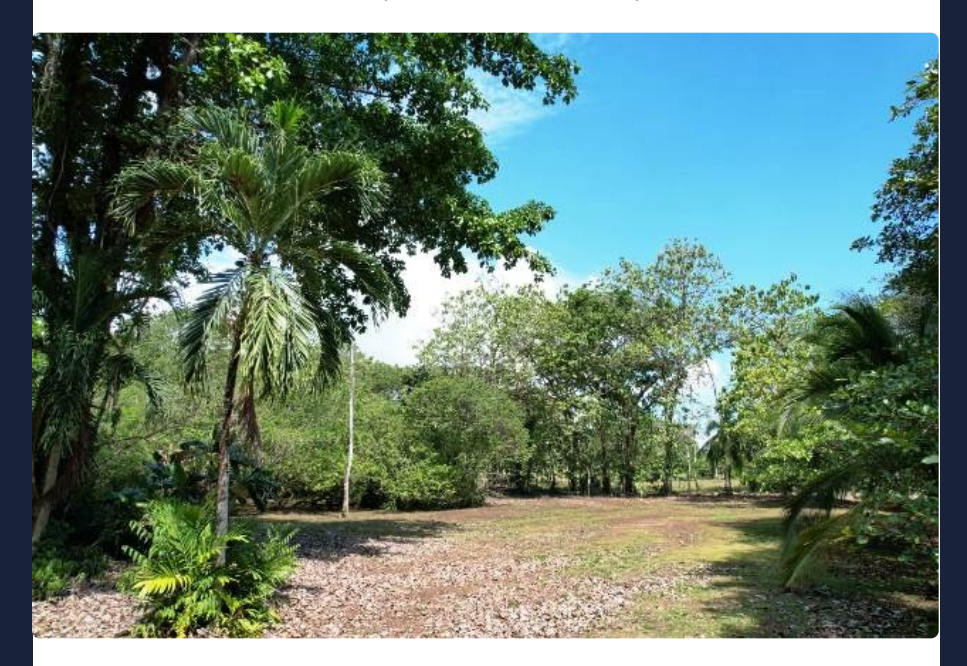
Welcome to Guanábana!!!

Today's new listing is a fully titled property a bit less than half way between the bustling peninsular center (and cradle of western civilization) Puerto Jimenez, and the mid-Pacific epic-center of surf, Matapalo.